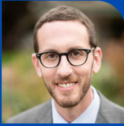
Scott Wiener California State Senator